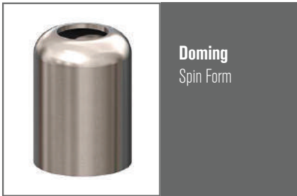
Doming Spin Form