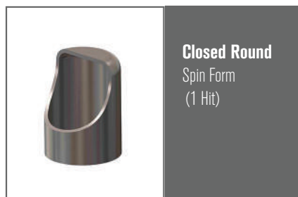
Closed Round Spin Form (1 Hit)