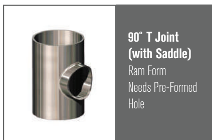
90° T Joint (with Saddle) Ram Form Needs Pre-Formed Hole

These forms only demonstrate a portion of the popular applications that we create. We also specialize in developing custom applications for the tube forming industry. For more information, please contact an engineer at Overton Industries - Tube Forming Systems at 317.736.7700.