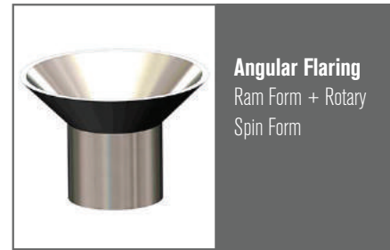
Angular Flaring Ram Form + Rotary Spin Form