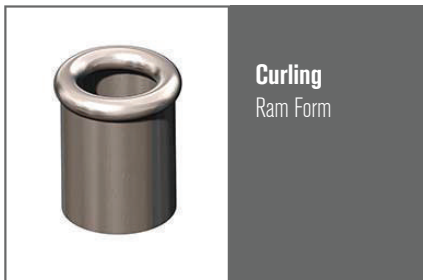
Curling Ram Form