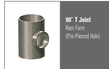
90° T Joint Ram Form (Pre-Pierced Hole)