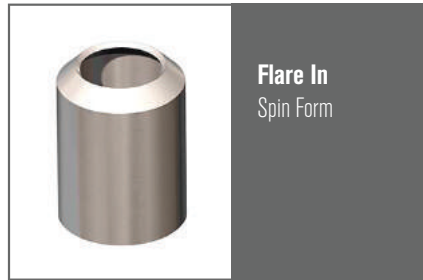
Flare In Spin Form