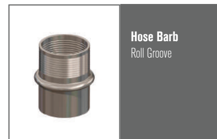
Hose Barb Roll Groove