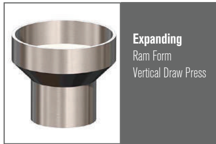
Expanding Ram Form Vertical Draw Press