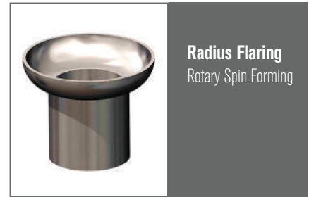
Radius Flaring Rotary Spin Forming