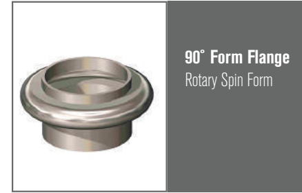
90° Form Flange Rotary Spin Form