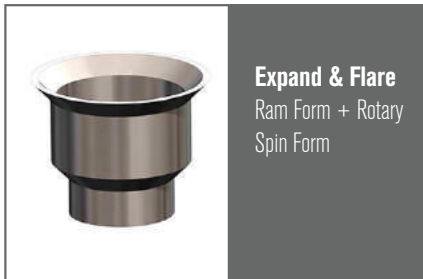
Expand & Flare Ram Form + Rotary Spin Form