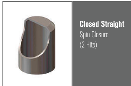
Closed Straight Spin Closure (2 Hits)