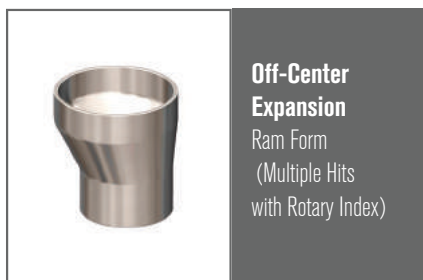
Off-Center Expansion Ram Form (Multiple Hits with Rotary Index)